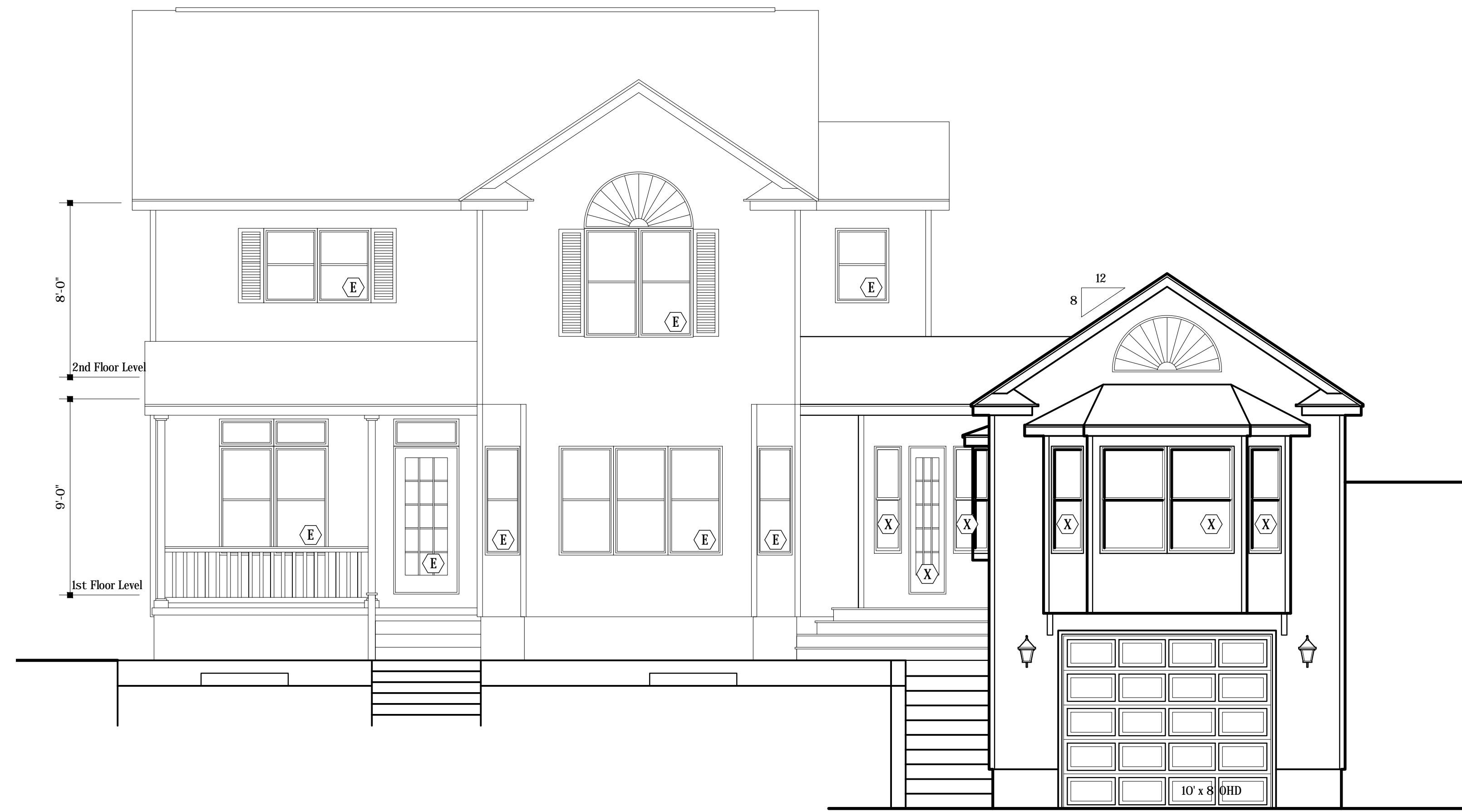
A2.1 | Front Elevation 1/4"=1'-0"