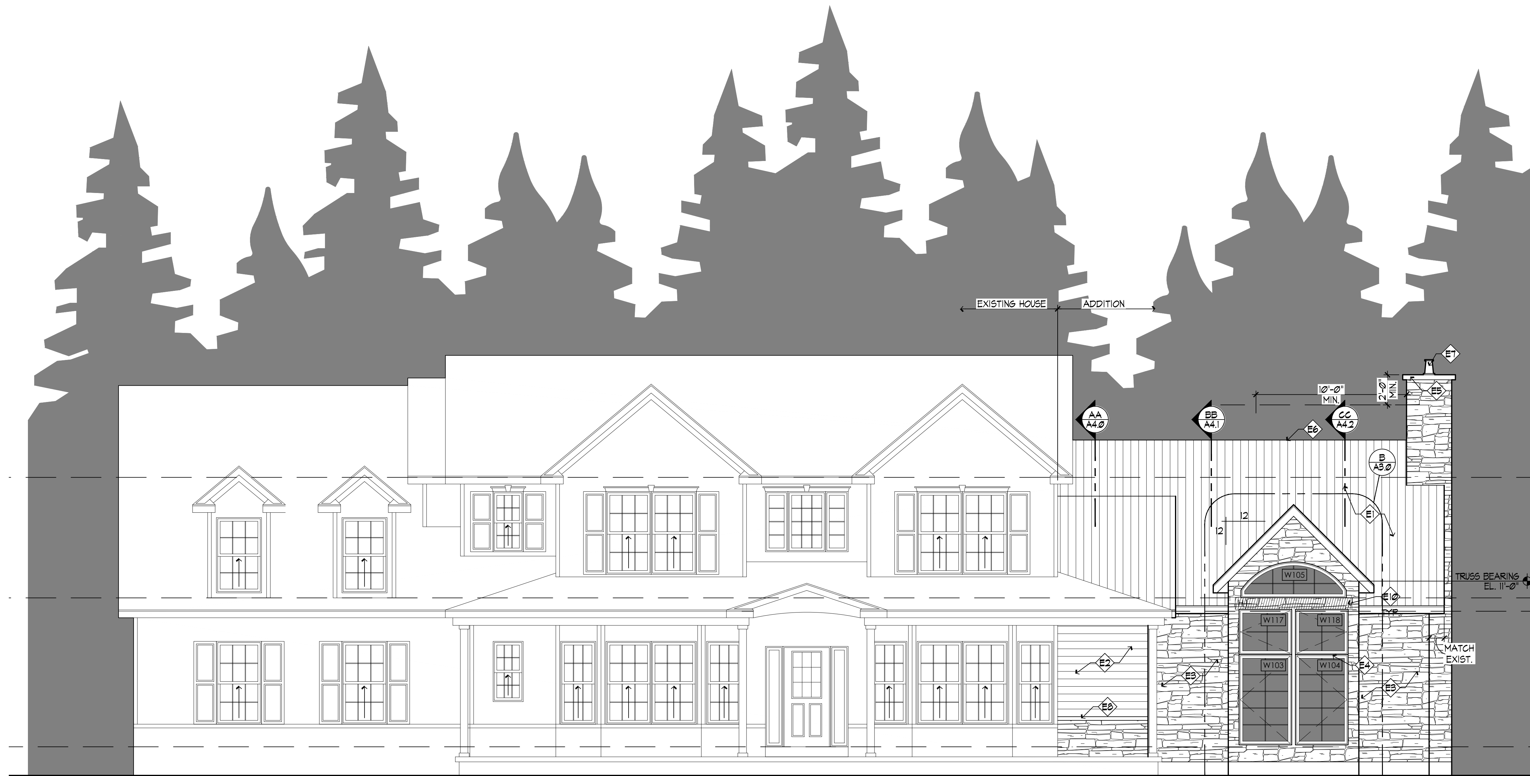
A SOUTH EXTERIOR ELEVATION SCALE: 1/4" = 1'-0"