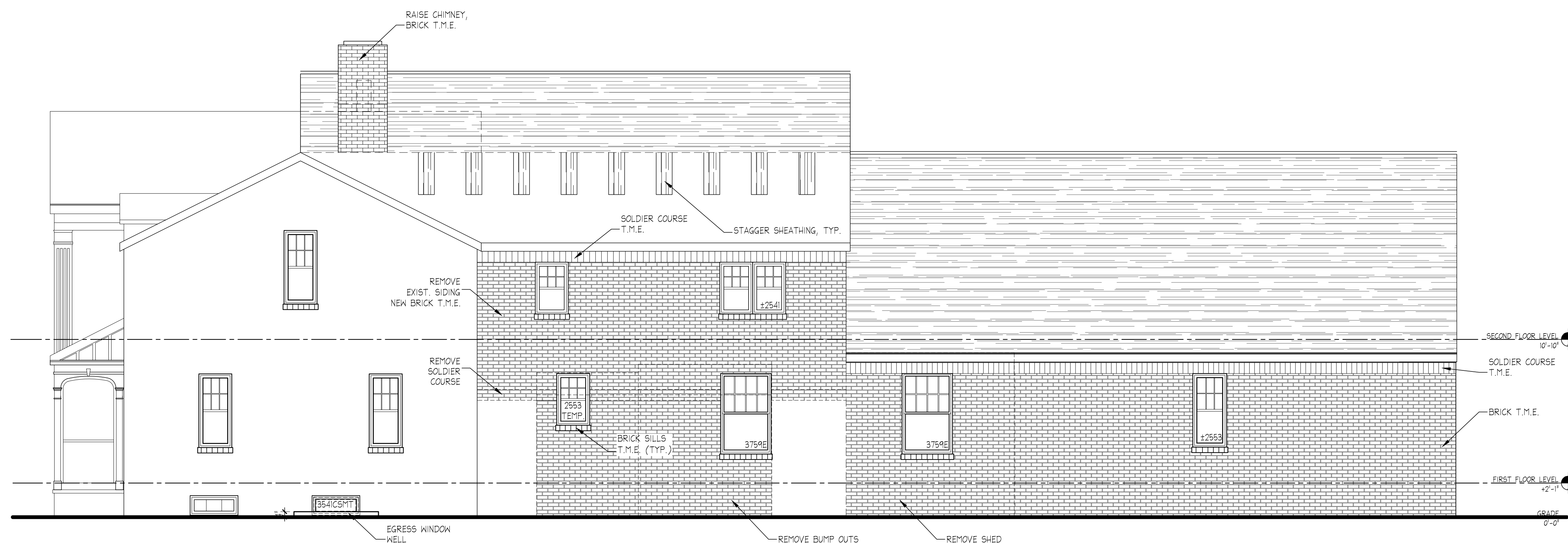
3 NORTH-WEST ELEVATION 1/4" = 1'-0"

Copyright 2020 Bammel Architects PC. All rights reserved. No part of this drawing may be reproduced or copied in any form by any means without the written permission of the architect. Any unauthorized alteration of or addition to this drawing/document is a violation of section 7307 of the New York State education law, article 145-a, paragraph 2.